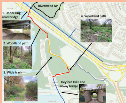
Walking route Rivermead to Sandford