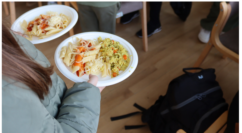
Yummy pasta, chicken and veggie rice lunches provided by Rose Hill Junior Youth club kitchen staff