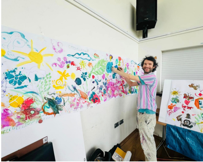
@MerlinPorterArts displays the amazing artwork made by local people at the big lunch