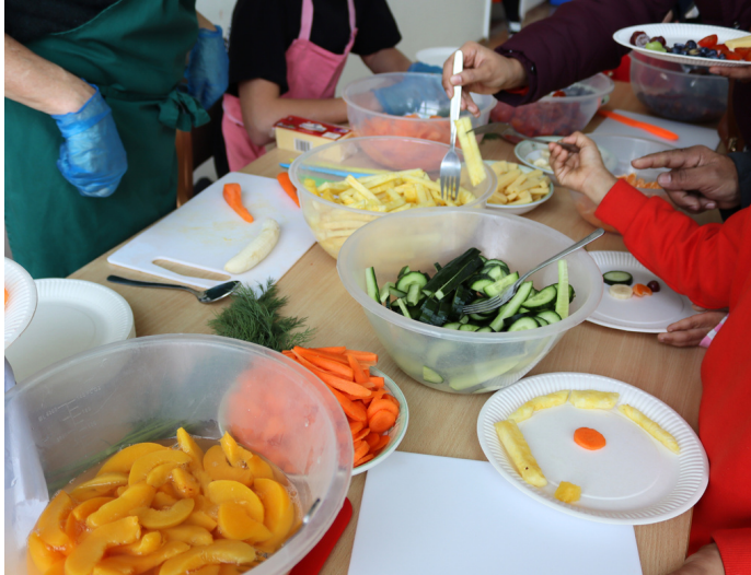
Families choosing their favourite fruits to make their refreshing fruity face designs!